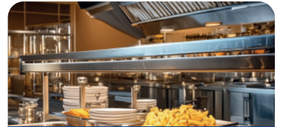
PROFESSIONAL KITCHENS AND CANTEENS