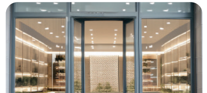
OFFICES, WAREHOUSES, STORES, GYMS