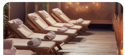
GYMS AND WELLNESS CENTERS