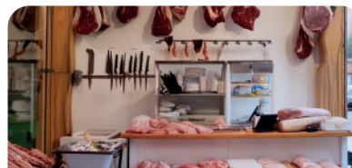
BUTCHER SHOPS, FISHMONGERS, BAKERIES