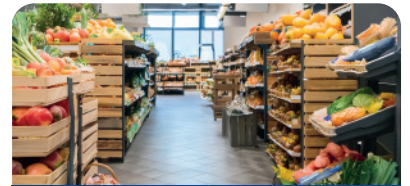
SUPERMARKETS AND GROCERY STORES