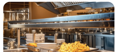
PROFESSIONAL KITCHENS AND CANTEENS