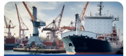
NAUTICAL AND RAILWAY