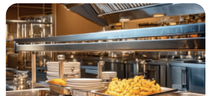
PROFESSIONAL KITCHENS AND CANTEENS