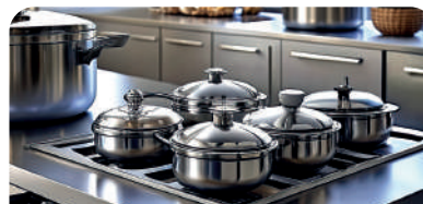
RESTAURANTS AND BARS